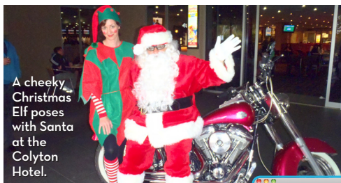
A cheeky Christmas Elf poses with Santa at the Colyton Hotel.

Welcome to the September edition of our newsletter. Below you'll find some exciting news on our new facebook page, new food workshop as well as highlights from some of our recent events.